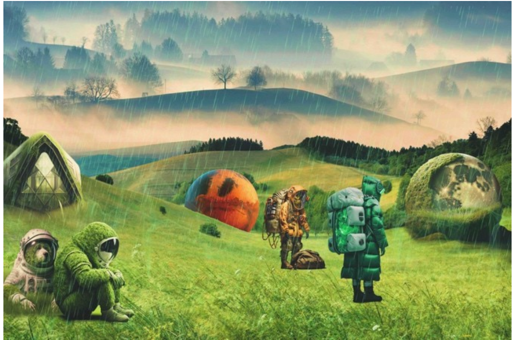
Denzel Muhumuza (Uganda)